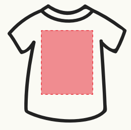
FULL BACK 10" - 14" WIDE