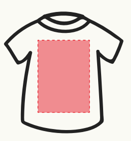
OVERSIZE FRONT 12" - 15" WIDE