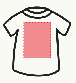
FULL FRONT 10" - 12" WIDE