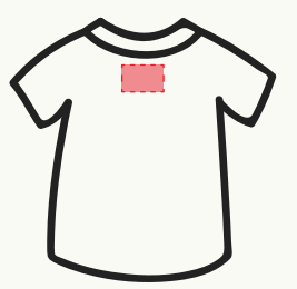
LOCKER TAG 1" - 3" WIDE