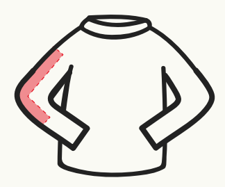
RIGHT LONG SLEEVE 9" - 10.5" WIDE