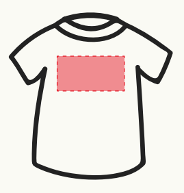
CENTER CHEST 6" - 10" WIDE