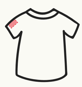
RIGHT SLEEVE 1" - 4" WIDE