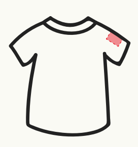
LEFT SLEEVE 1" - 4" WIDE