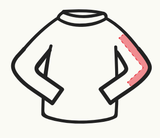
LEFT LONG SLEEVE 9" - 10.5" WIDE