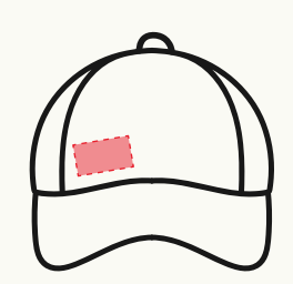
RIGHT PANEL 1.75" - 2" WIDE