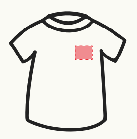
LEFT CHEST 2.5" - 5" WIDE